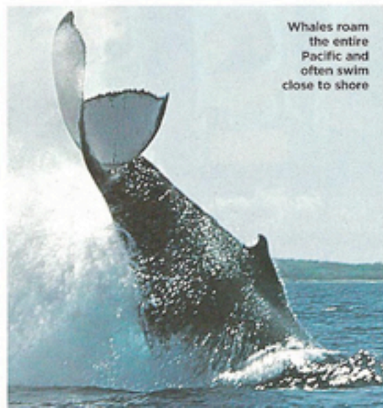
Whales roam the entire Pacific and often swim close to shore