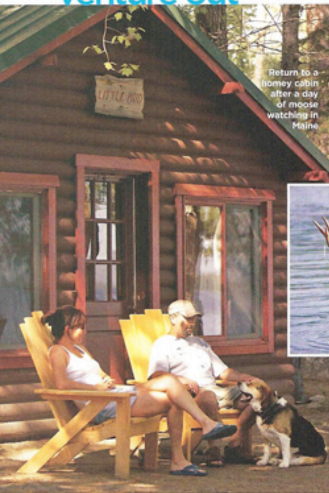
Return to a homey cabin after a day of moose watching in Maine.

the crowd-free Dwelly Pond to see them, or rent a canoe at Trout Brook Farm campground to spy on moose that feed near the shores of Lake