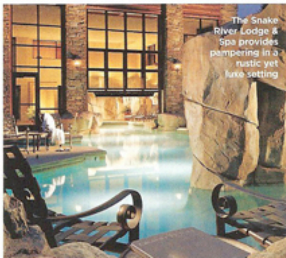
The Snake River Lodge & Spa provides pampering in a rustic yet luxe setting.

The park's many bogs and ponds are prime moose habitat for do-it-yourself wildlife watches (just use common sense and always give a moose a wide berth). Hike the three-mile round-trip route to